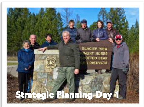
Strategic Planning Day 1

As of December, we have purchased a laptop, QuickBooks and membership/donation management software to streamline the administration side of our operations, and are in the process of developing a 5-year strategic plan to guide our future efforts to maximize our impact. We are so grateful to NEEF for this grant to help us take our organization to the next level!